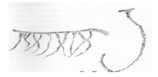
Fig 1 An instance of a logogram ^{\rm l} as given in the Viswa Vijnana Kosham (World Encyclopedia, Malayalam translation, 1972, p. 81)

Sound is a basic and natural form of language. The alphabet is the terminology for indicating the uttered sound, the letter. Varamozhi – a common Malayalam phrase where ideas are expressed through painting – emphasises that registration of some technical lines is necessary for forming meaningful words. The lines represent terminology to form the letters or alphabet. The letters, commonly