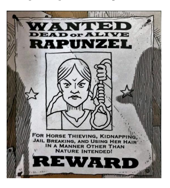
Image 5. Poster showing how Rapunzel uses her hair in a manner that is socially unaccepted.

breaking and for using her hair in a fashion that is different from the way nature intended her to use it. The accompanying image in the graphic novel depicts Rapunzel holding her braid, like a noose.