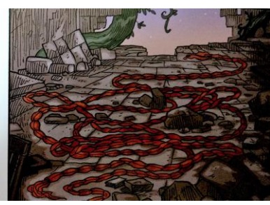
Image 6. Horror in Rapunzel's face depicts her emotion on having her hair cut.