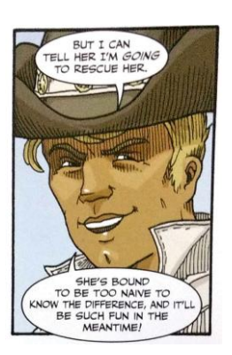
Image 3. Countering the character of the fairy tale prince, to show that Rapunzel isn't dependent on him. Retrieved from Rapunzel's Revenge (2008)

exiting the forest. The prince in Grimm's "Rapunzel" is a romantic who falls in love with Rapunzel because of her sweet voice and goes on to have an affair with her. Hale does not get into the romantic side of the tale. She unpacks the romantic notion of prince charming going on an adventure to rescue the damsel in distress which has been used in earlier versions of the tale. Men tend to believe this notion and assume that women want to be rescued. In Rapunzel's Revenge, the prince says he was getting bored at his farm and had hence followed the tales of a beautiful maiden trapped in a high tower. Hale's Rapunzel is not one to sit tight waiting for the prince to come along. She asks the strapping young man if he was heading to "help her" (Hale, 2008, p. 41) but the prince ends up saving "I can't actually rescue her, of course. The word is she's Mother Gothel's pet and I won't risk crossing the old lady. But I can tell her I'm going to rescue her. She's bound to be too naïve to know the difference, and it'll be such fun in the meantime." (Hale, 2008, p. 41)