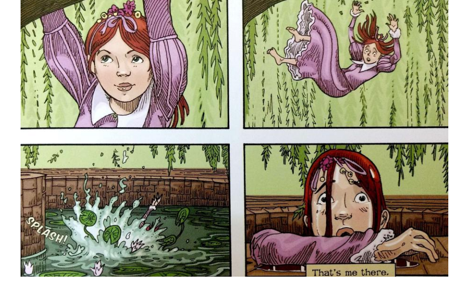
Image 1. Rapunzel's entry in the book, where she doesn't appear to be the quintessential princess. Retrieved from Rapunzel's Revenge (2008)

swinging from any awning, only to crash land into a pool of water. Rapunzel's Revenge eliminates the whole idea of the perfect and dainty princess the moment readers reach the panel where Rapunzel peers out of the pool and states, "That's me there." (Hale, 2008, p. 5) Her hair is matted and wet, and the readers realise that Rapunzel is a clumsy little girl.