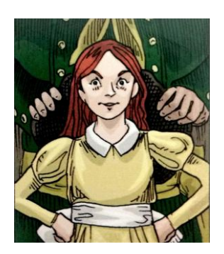
Image 2. Rapunzel's demeanour is different from the traditional character. Retrieved from Rapunzel's Revenge (2008)

Her behaviour ultimately backfires and she is imprisoned in a magical tree-tower in the middle of the forest. She tries to lie and escape the tree but when Mother Gothel realises her plan, she does not think twice before speaking her mind to Mother Gothel. Rapunzel says, "I guess I'd never stood up to Mother Gothel... I was scared spitless, but I knew that I could not pretend anymore." (Hale, 2008, p. 32)