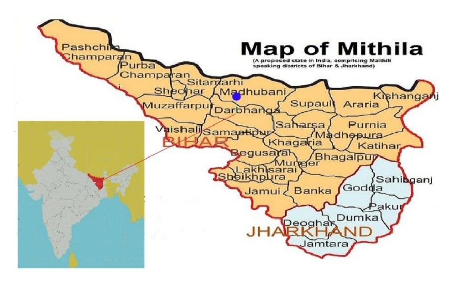
Map 1 Location Map of Madhubani, Bihar

Moreover, in India, handicrafts being an unorganized sector of theeconomy, as there is alack of production, sales, exports and artisan data for a particular art form, specifically, data on the tourist to the region, expenditure on the art form and their significance to the socio-economic upliftment of the community/ region. Although, according to the officials of the Marketing and Service Extention Center (Handicrafts), Madhubani; in 2015, there are more than 26,000 artists registered as 'Artist of Mithila Painting' under the jurisdiction of the office, besides equivalent innumber registered with other States and/or regional offices. Moreover, the export statistics for handicrafts reveals that under the specific category of handicrafts "Painting, Drowing and Pastels" the Mithila (Madhubani) Painting occupied a dominant and promising position in India. In the financial year 2016-17; the export of Mithila/ Madhubani Painting mounted at all time high, with 925.35% rate of growth (against US$ 1.69 of 15-16) shown impressive growth in export and account for US$ 17.37 million (9.34%) against total export of US$ 186 millionin thecategory of "Painting, Drowing and Pastels" (Department of Commerce, 2017). The painting is popular among the western art lovers and triggers demand from UK, USA, HongKong, Nepal, Canada,