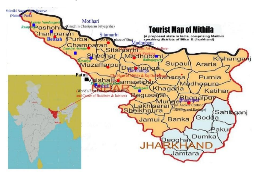
Map 2 Tourist Map of Select Districts of Mithila