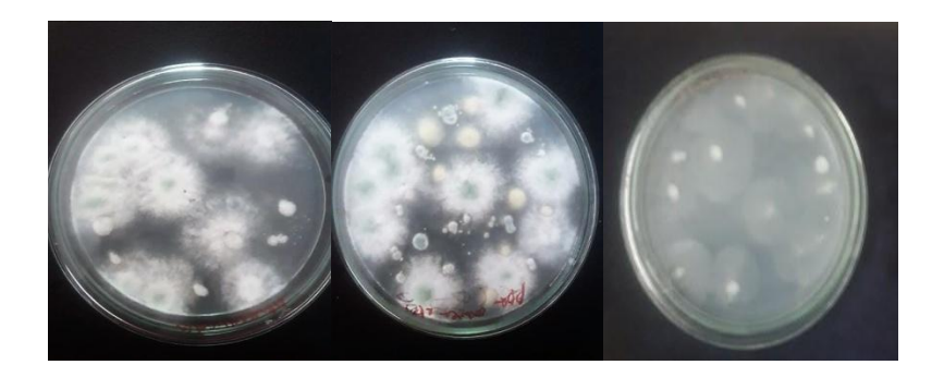
Plate 2: Bacterial colony in a) areca nut field b) paddy field c) banana field @10-6 dilution