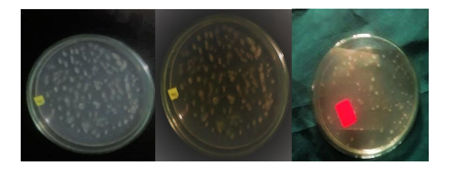
Plate 1: Photograph of the incubated plates of Bacteria and Fungi