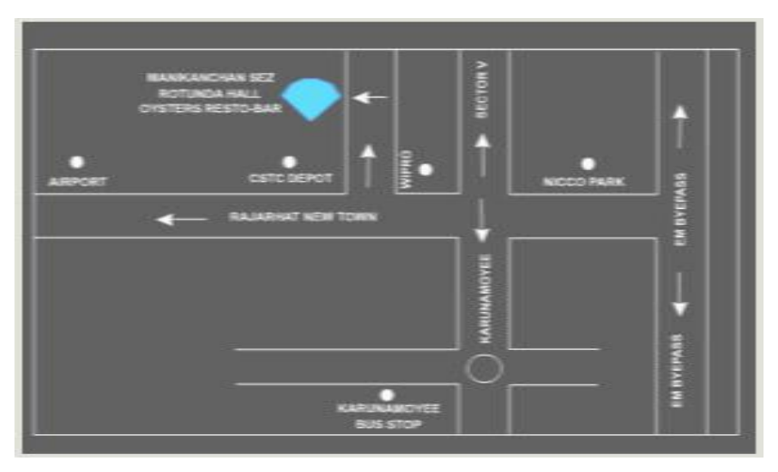
Fig 1: Manikanchan SEZ, Rajarhat, Kolkata

Manikanchan SEZ:In our study, the case of Manikanchan has been incorporated as a special instance. This sole Gems and Jewellery Special Economic Zone (SEZ) of the country is situated in Rajarhat, Kolkata, West Bengal. It started its operation since 2006. This SEZ functions as an offshore unit with several financial and nonfinancial benefits.