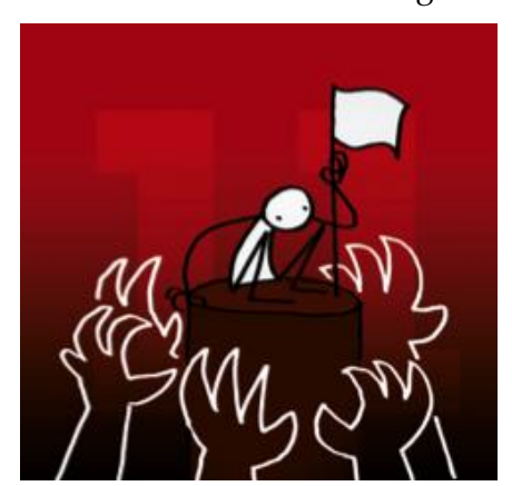
Fig 4: Accompanying Article 11

The stick figures force us to see humans behind and beyond the lines. But in the very effect of minimalist representation, it implies that these are the irreducible forms of the human: a human cannot be anything less than these stick figures . We cannot, in other words, take away these lines and expect the 'figure' or its remnants to resemble and recall a human. The stick figures are the blueprints for the person to come . They are the grounds upon which the edifice of the human has to be imagined, rather like the building plans which, when viewed, cause/enable us to visualise the entire structure. In other words, the stick figures are the basic building blocks of our imagining a human person, one who will then be deserving of rights. One does not, suggests the image, require a photograph of a human to imagine a human. With the barest set of lines, one can conjure up a human who then merits these rights.