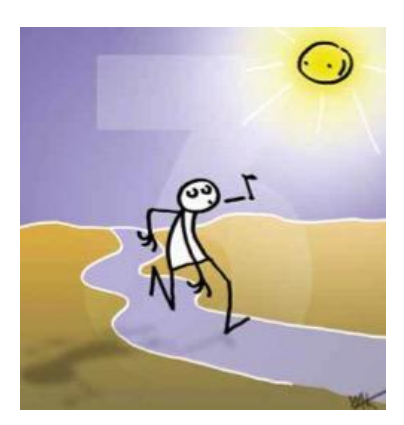
Fig 3: Image accompanying Article 3

Linfield further proposes that, since the photograph doesn't itself explain, viewers 'must look outside the frame to understand the complex realities out of which these photographs grew' (p. 51). I propose that the image drawn in the UDHR is explained by the Articles of the UDHR.