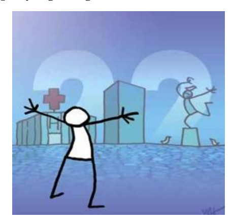
Fig 5: Accompanying Article 22

The arts (a statue or a dancer) representing cultural rights and the red cross emblem of the health services face the stick figure – who is either appealing to them or is in thrall with them, these social apparatuses of security and self-realisation.