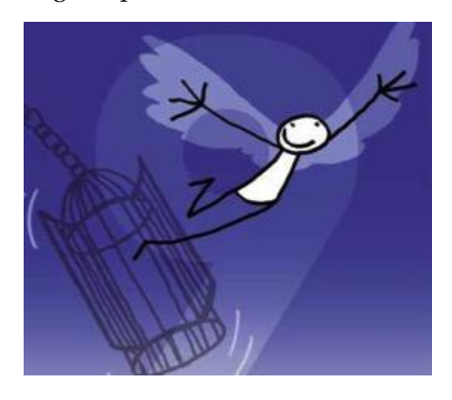
Fig 4: Image accompanying Article 9

This text of the Article is the anticipation and explanation of the image, where the right to life, freedom and security belongs to all. The sun and the open road with no barrier or threat are available to the runner. The runner is free to utilise these, is at liberty to choose the path ahead. The image is drawn in the context of the verbal text. Take another instance, of Article 9. The image shows a person escaping a cage whose door is open. The text reads: 'no one shall be subjected to arbitrary arrest, detention or exile'. The text illuminates the image, explains it.