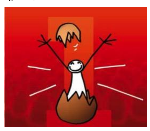
Fig 2: Image accompanying Article 1

Following Lauren Wilcox who proposes that security discourse may be treated as performative, 'producing and sustaining embodied subjects within a broader social order' (p. 29), then, I suggest UDHR's illustrated version is a verbal-visual discourse that performs the human subject as an anonymous yet identifiably human person. The verbal text of Article 1 speaks of the human being as the subject of rights. It says "All human beings are born free and equal in dignity and rights. They are endowed with reason and conscience and should act towards one another in a spirit of brotherhood". The image accompanying shows us a human person emerging (See Figure 2).