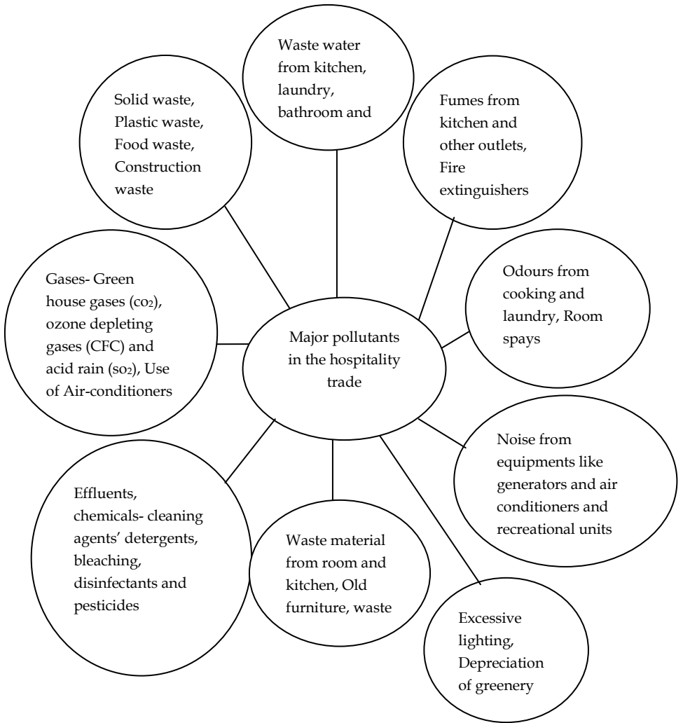
Fig.1: Major Pollutants in the Hospitality Trade: