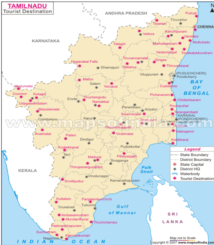
Fig. 1: Districts of Tamil Nadu: Groove Name

Tamil Nadu: Treasure of Shrines and Multi-Faceted Institution; Source: www.mapsofindia.com