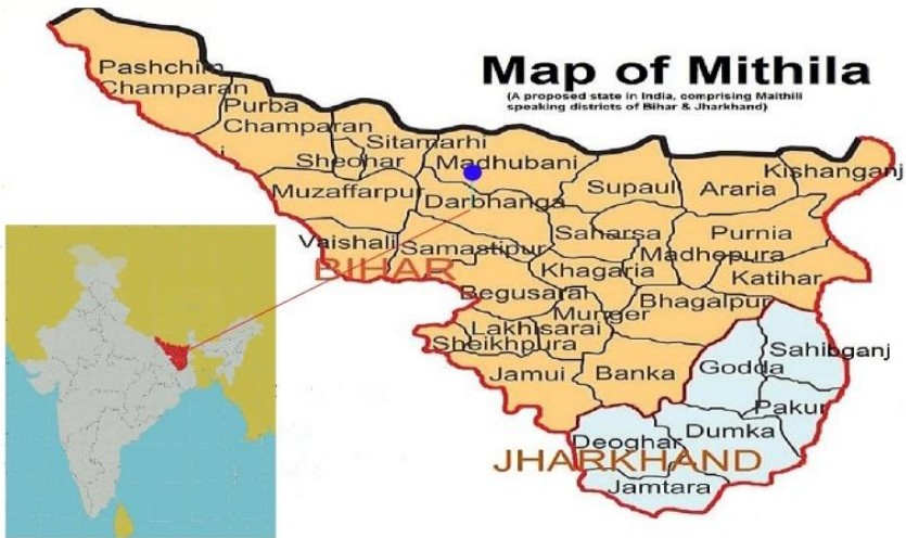
Map 1 Location Map of Madhubani, Bihar

Moreover, in India, handicrafts being an unorganized sector of the economy, as there is a lack of production, sales, exports and artisan data for a particular art form, specifically, data on the tourist to the region, expenditure on the art form and their significance to the socio-economic upliftment of the community/region. Although, according to the officials of the Marketing and Service Extension Center (Handicrafts), Madhubani; in 2015, there are more than 26,000 artists registered as ‘Artist of Mithila Painting’ under the jurisdiction of the office, besides equivalent in number registered with other States and/or regional offices. Moreover, the export statistics for handicrafts reveals that under the specific category of handicrafts “Painting, Drawing and Pastels” the Mithila (Madhubani) Painting occupied a dominant and promising position in India. In the financial year 2016-17; the export of Mithila/ Madhubani Painting mounted at all time high, with 925.35% rate of growth (against US$ 1.69 of 15-16) shown impressive growth in export and account for US$ 17.37 million (9.34%) against total export of US$ 186 million in the category of “Painting, Drawing and Pastels” (Department of Commerce, 2017). The painting is popular among the western art lovers and triggers demand from UK, USA, Hong Kong, Nepal, Canada,