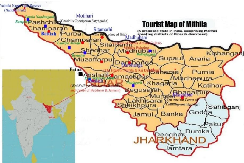
Map 2 Tourist Map of Select Districts of Mithila