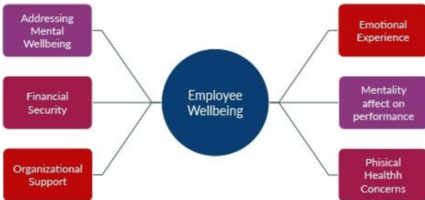
Figure 1: The image illustrates the different levels at which the employee’s well-being is affected.