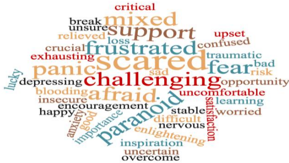
Figure 2: Shows the emotional experience of the respondents during the pandemic

Figure 2 illustrates the various emotions that employees felt during the pandemic about their work, health, future and family.