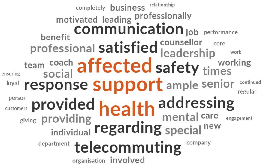
Figure 5: Word Cloud shows the most frequent words used by the respondents for the theme Organizational Success

A majority of the respondents also agree that when it comes to leadership during the pandemic their organisations are doing a good job and are satisfied with the communication they are getting from the organisation about its response to the Covid-19 pandemic. Most organisations provided their employees with telecommuting support.